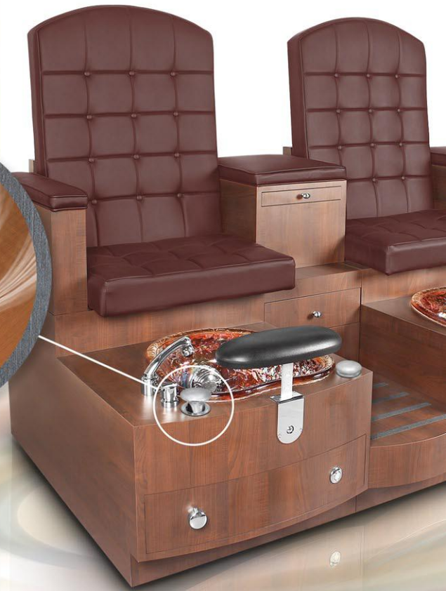
GULFSTREAM Air Vent System Adjustable